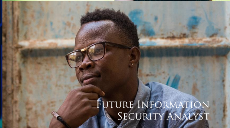
FUTURE INFORMATION SECURITY ANALYST