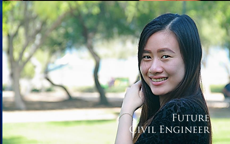
FUTURE CIVIL ENGINEER